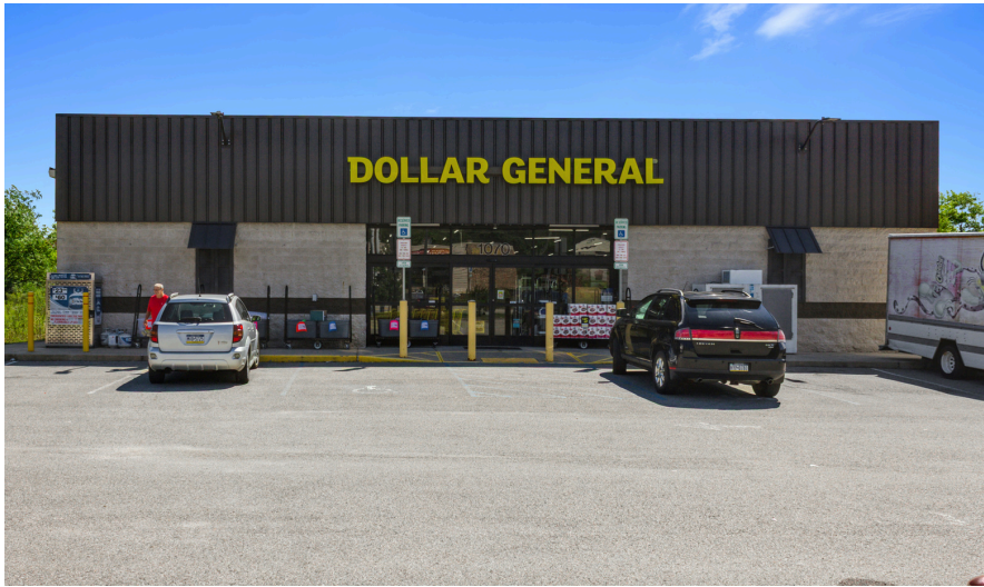
Dollar General Jeannette, PA