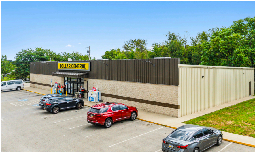
Dollar General Industry, PA