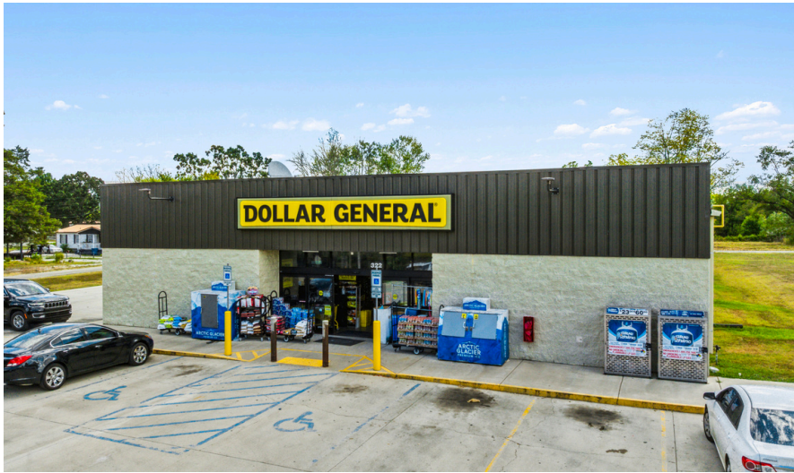
Dollar General Taneyville, MO