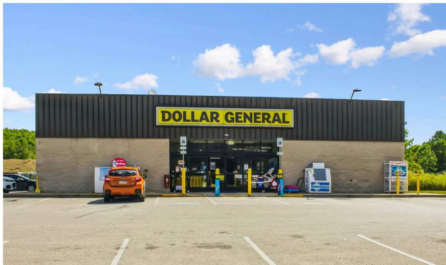
Dollar General Franklin, PA