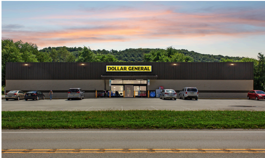
Dollar General North Apollo, PA