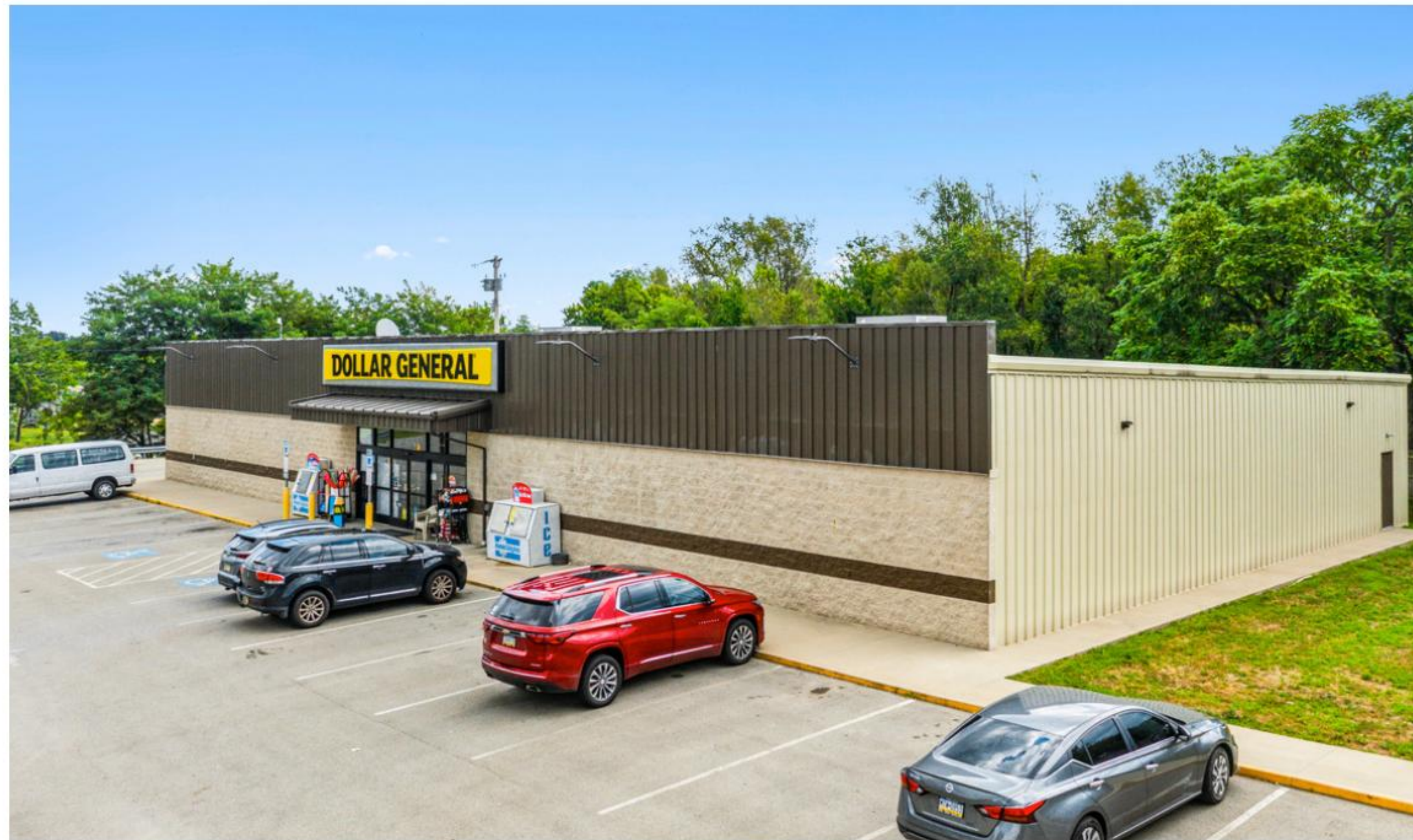
Dollar General Industry, PA