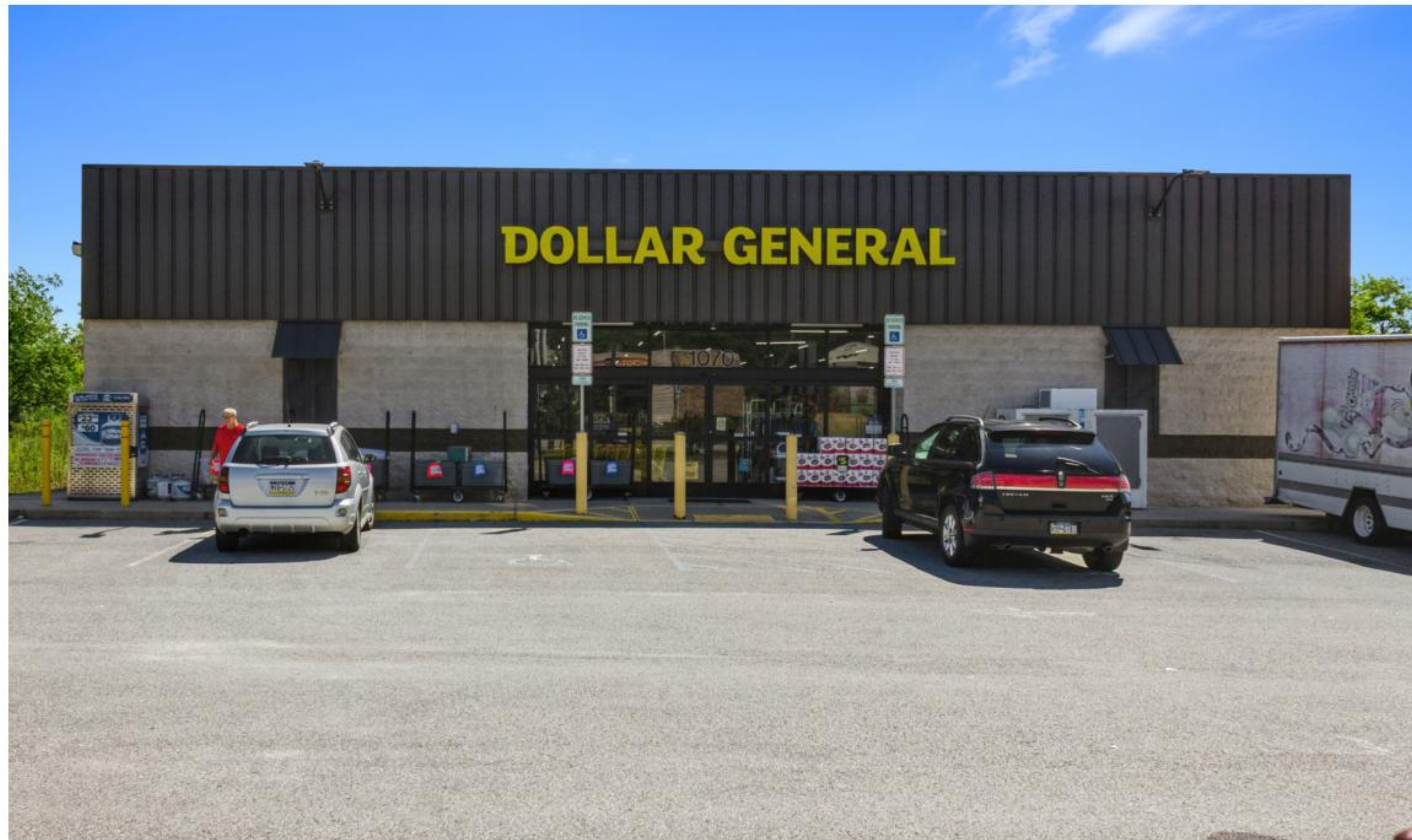
Dollar General Jeannette, PA