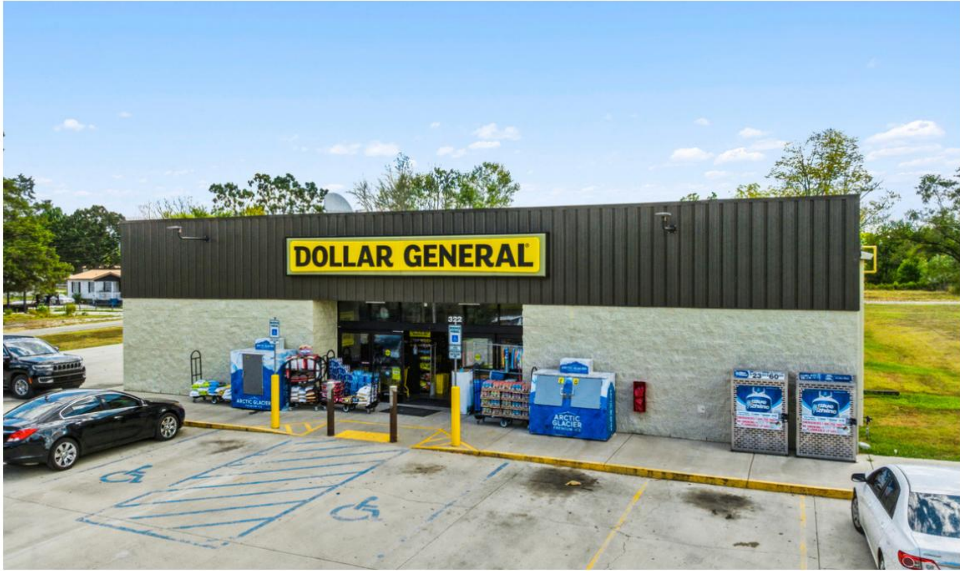
Dollar General Taneyville, MO