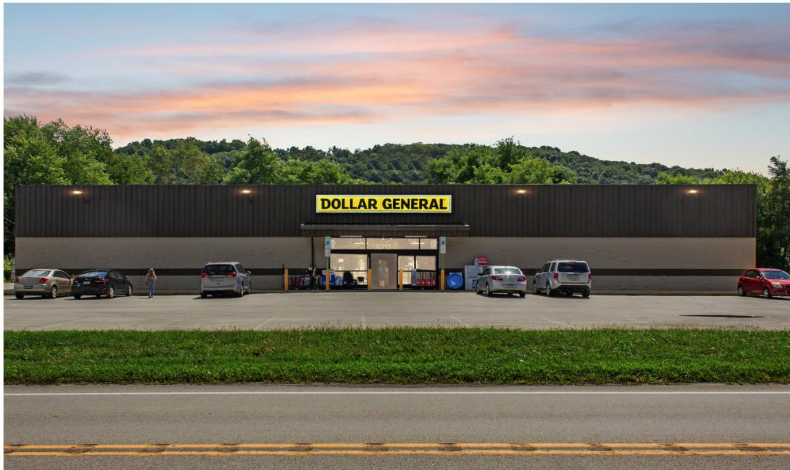
Dollar General North Apollo, PA