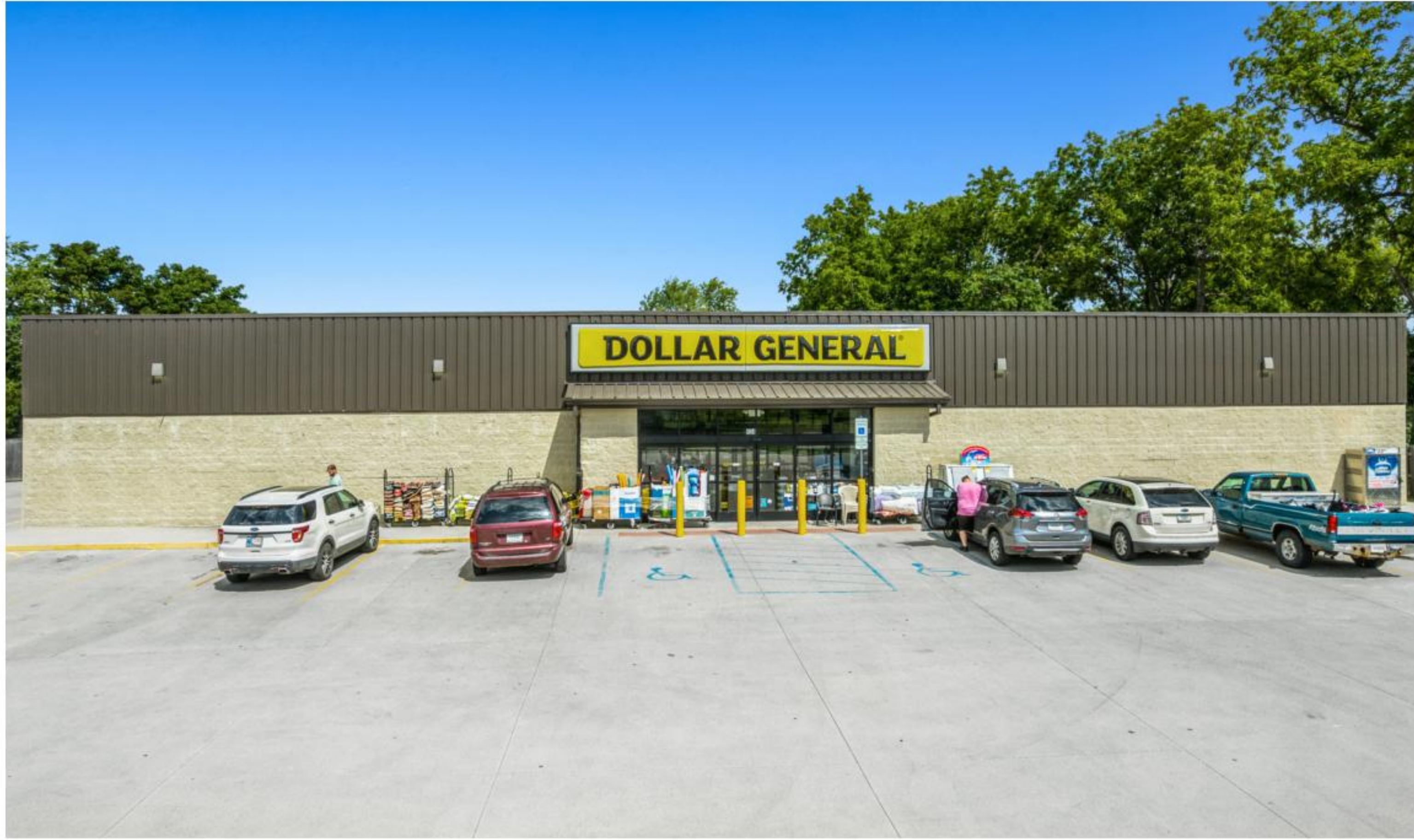
Dollar General Goodland, IN